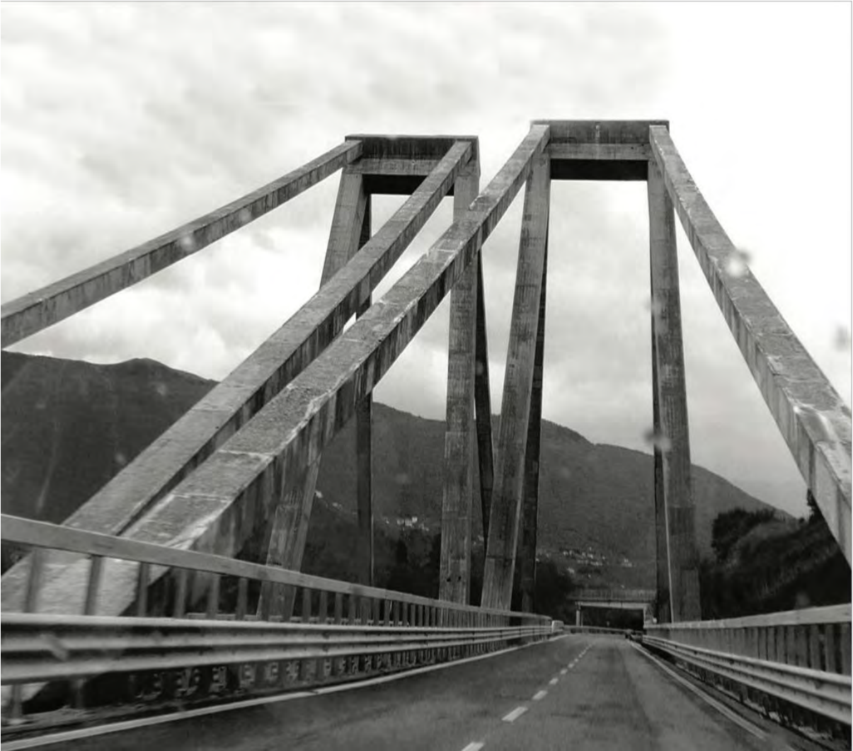
Fig.04 – Photo of the bridge along the road