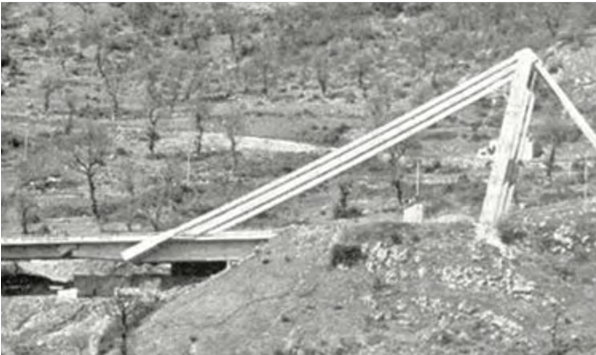
Fig.03 – Historical photo of the bridge support point (“Cassa del Mezzogiorno” archive, 1980)