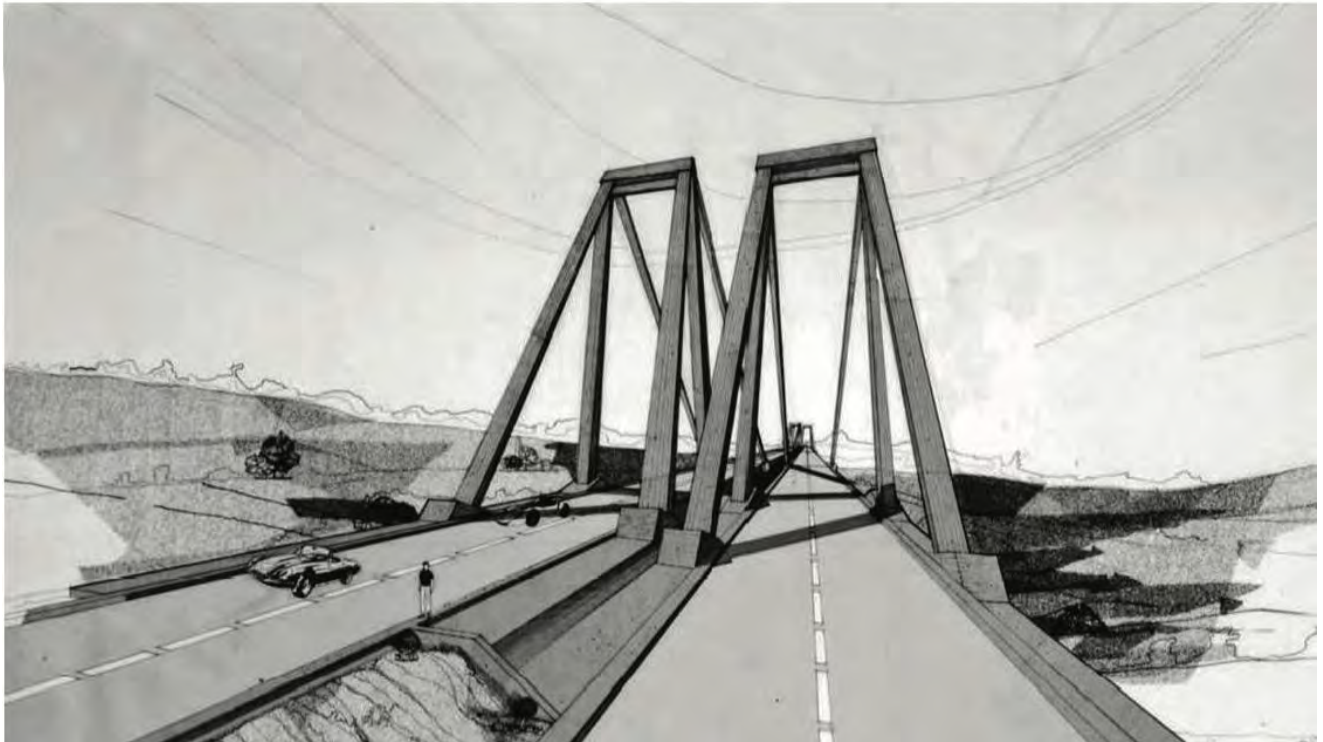
Fig.01 – Design section and perspective (Riccardo Morandi, 1977)