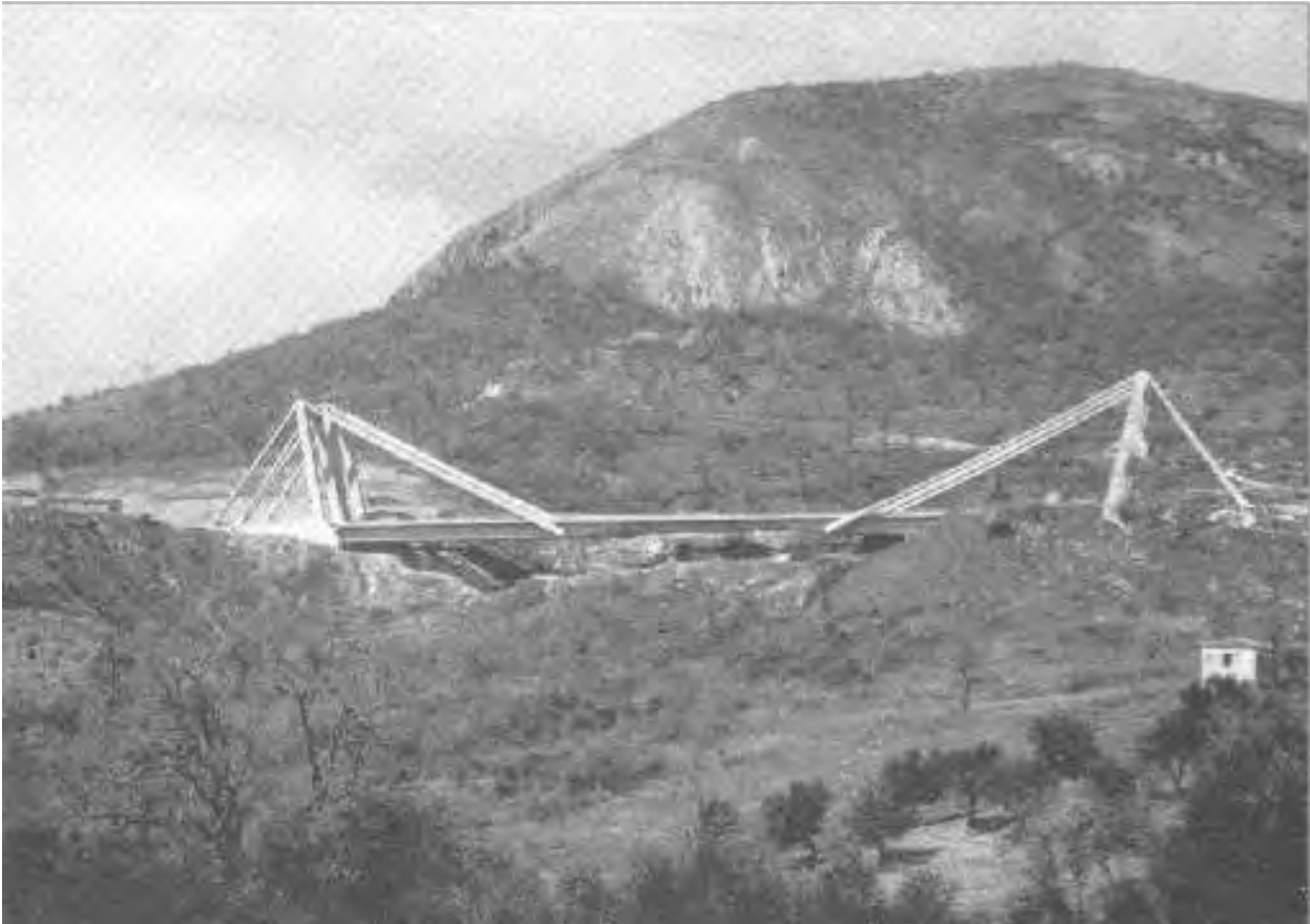
Fig.02 – Historical photo of the construction site (“Cassa del Mezzogiorno” archive, 1980)