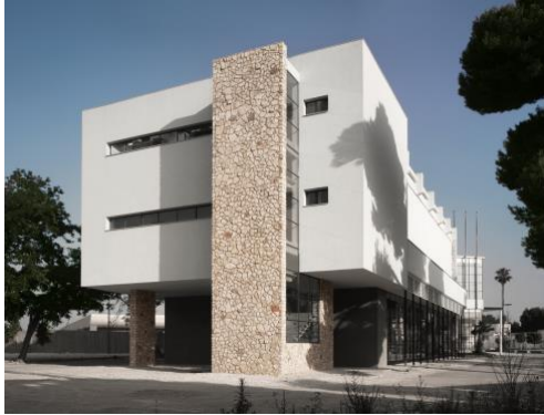
Fig.10 – East elevation view of completion (Alberto Muciaccia 2016)