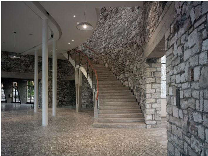
Fig.05 – Photo of the entrance hall