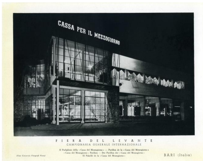
Fig.02 – Night view (1951- Consorzio Fotografi Fiera)