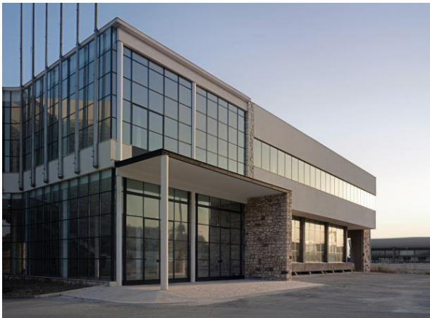
Fig.01 – View of the main facade (Alberto Muciaccia 2016)