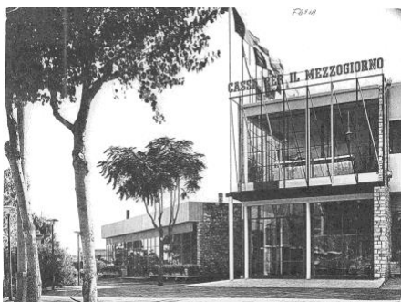
Fig.03 – Photo of the entrance (ca. 1951)