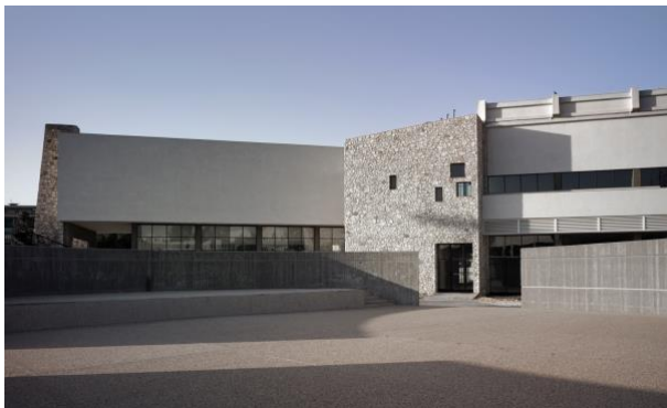
Fig.09 – Rear elevation view with arena (Alberto Muciaccia 2016)