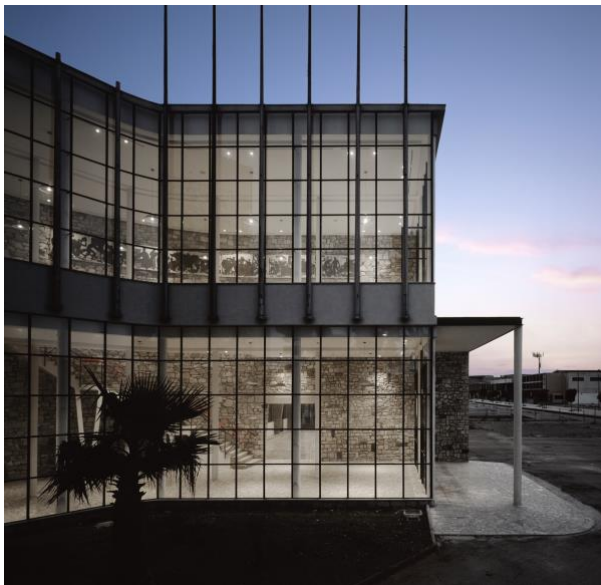
Fig.08 – Night view Hall (Alberto Muciaccia 2016)