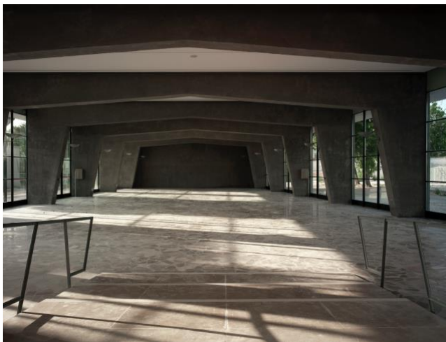
Fig.06 – Trident room photo