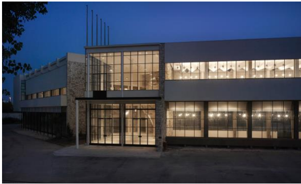
Fig.07 – Night front view